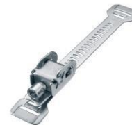
Closing element for universal clamp band

Oetiker manufactures products according to our internal drawing specifications and dimensions.