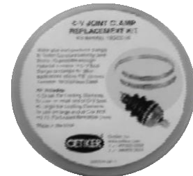
CV Joint Replacement kit

Oetiker manufactures products according to our internal drawing specifications and dimensions.