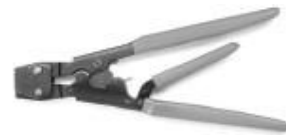
Part no: 14100280 3-Handle Ratchet Pincer