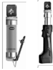
Pneumatic & cordless pincer