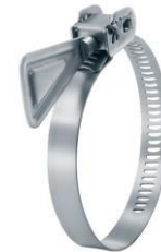
Worm Drive Clamps - Screw Clamps with wing screw