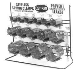
Spring Clamp Rack

Oetiker manufactures products according to our internal drawing specifications and dimensions.