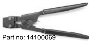
Part no: 14100069 2-Handle Ratchet Pincer